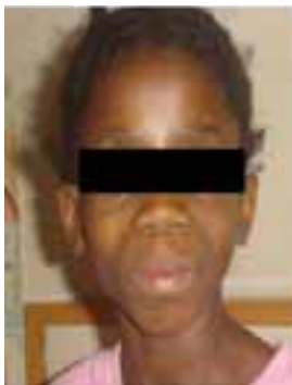
Figure 1: Example of lipodystrophy